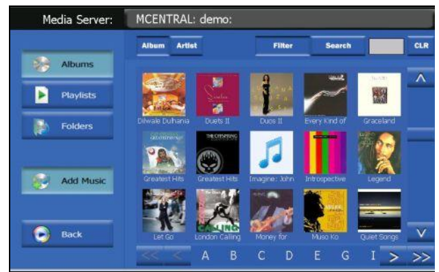
Screenshot: mPanel Software (Music Selection)