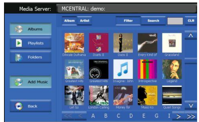
Screenshot: mPanel Software (Music Selection)